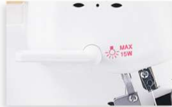
Built-in sewing lamp