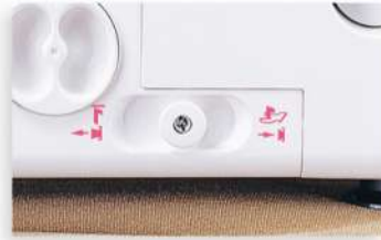
Built-in upper knife clutch device