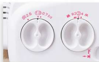
Differential and stitch length knobs