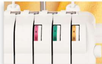
Built-in tension adjusting device