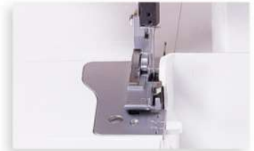
Built-in rolled hem : No need to change the needle plate