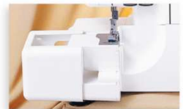
Free arm : Detachable extension plate for free arm sewing