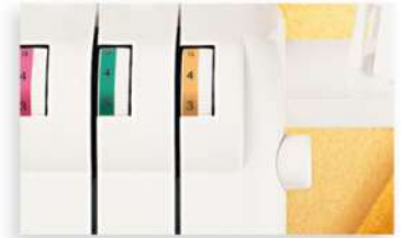
Tension release : To ensure all 3 threads can be inserted in the discs. You can also remove the finished work piece without the interruption on tensions.