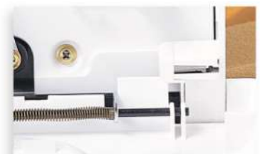
Safety switch : To prevent any danger while looper cover is opened