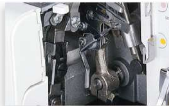
Auto looper threader